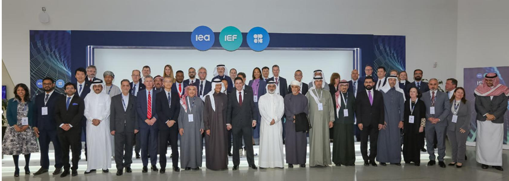
15 th IEA-IEF-OPEC Outlooks Symposium

IEA-IEF-OPEC trilateral program to promote energy market stability, trade and investment