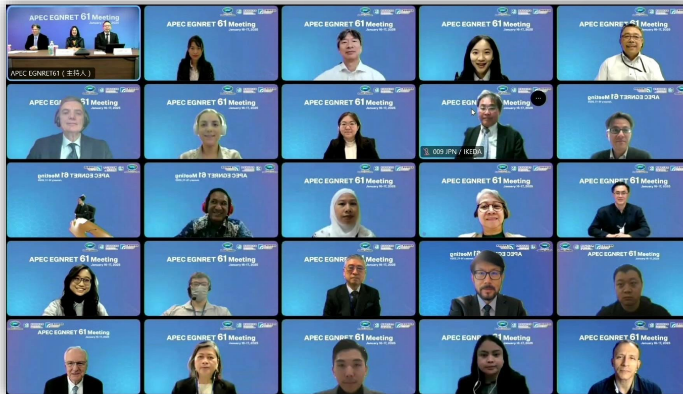
APEC EGNRET 61 – Group Photo