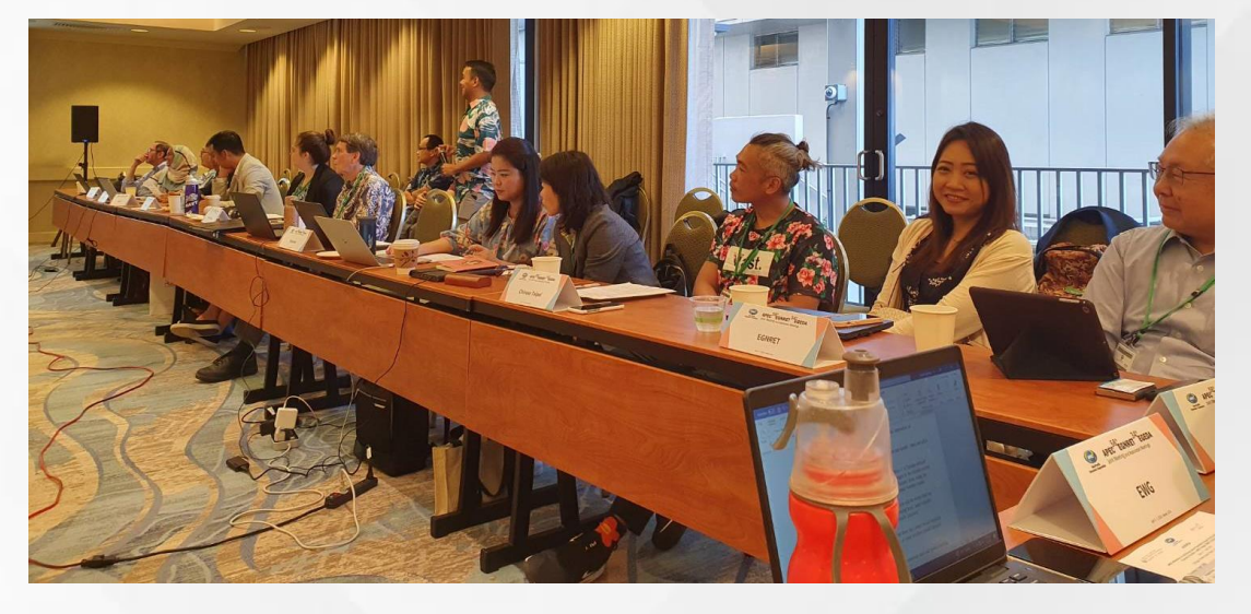
US Workshop on Promoting Net Zero and Carbon Neutral Commitments

APEC Workshop on Achieving Carbon Neutrality through Bio-Circular-Green Economy Principle in APEC Region