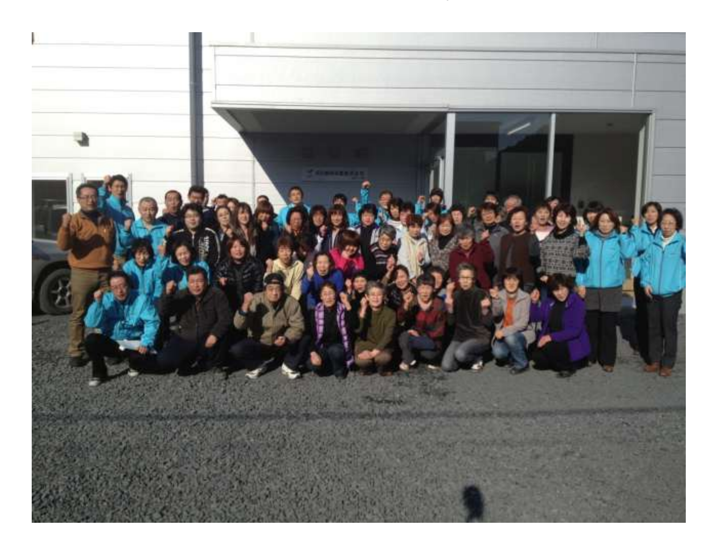
Thank you for your support, Arigato!