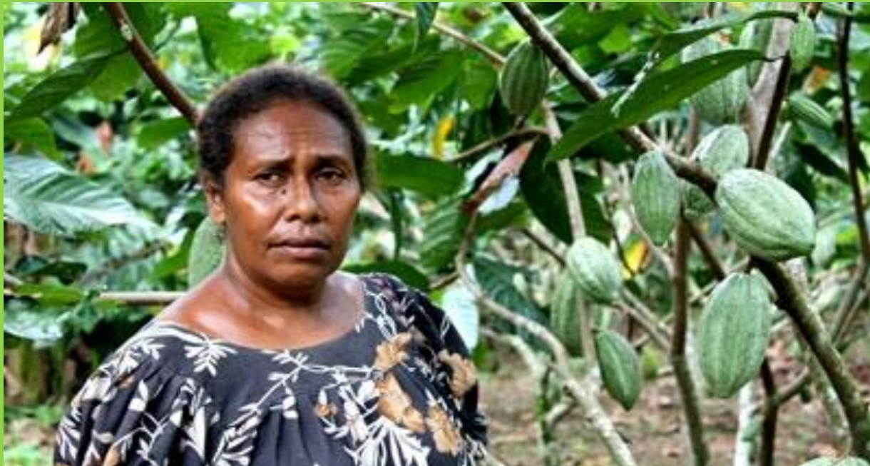
PNG Woman Cocoa Farmer & Entrepreneur