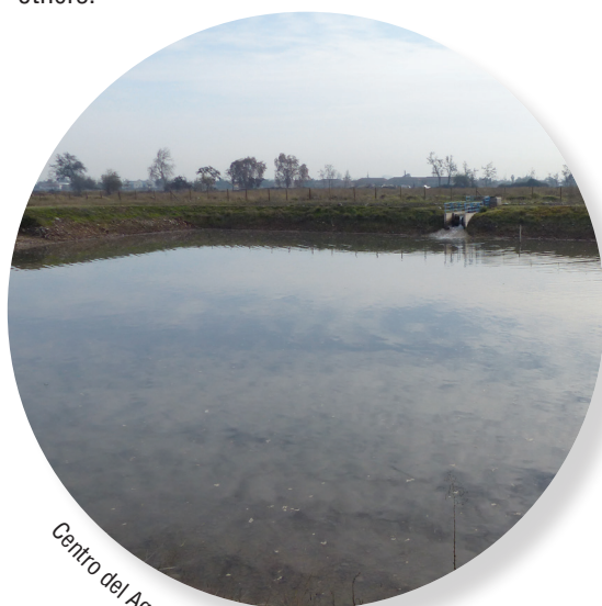
Centro del Agua UdeC