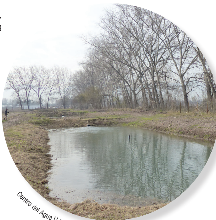
Centro del Agua UdeC