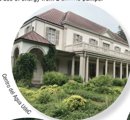
Centro del Agua UdeC