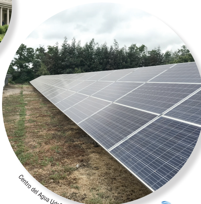
Centro del Agua UdeC