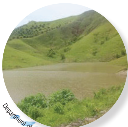
Department of Agriculture VII, Philippines