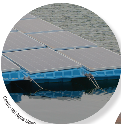
Centro del Agua UdeC