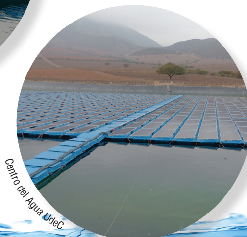
Centro del Agua UdeC