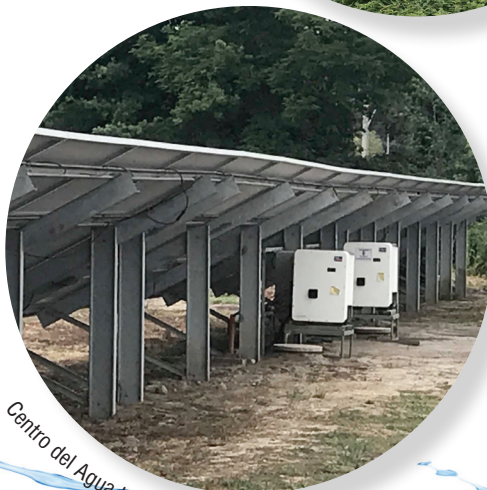
Centro del Agua UdeC