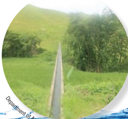
Department of Agriculture VII, Philippines