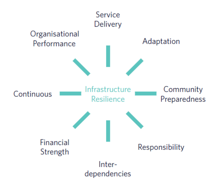
Figure 2: Resilience attributes

Incorporating resilience considerations into strategic thinking, planning and funding therefore requires a level of capability across central and local government in understanding resilience. Below we discuss two initiatives that have been undertaken in New Zealand, the Lifelines Council and incorporation of consideration of resilience into planning for transport infrastructure.