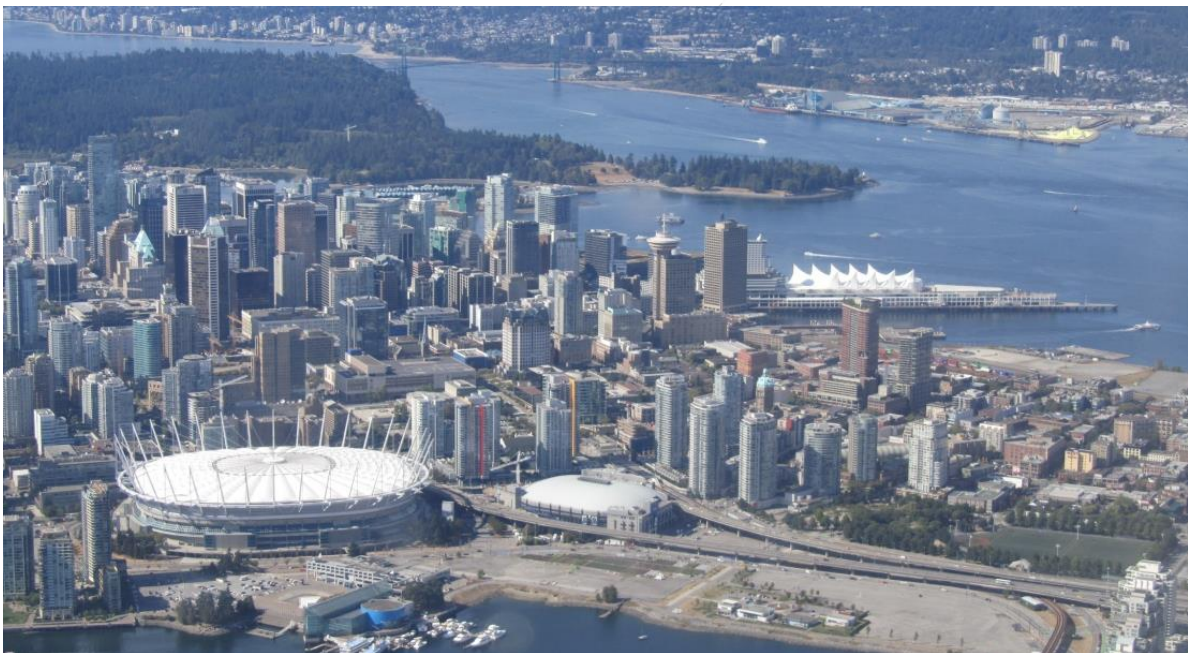
Photo 15.3 Aerial View of Vancouver

Vancouver International Airport has the second highest passenger traffic to the Asian and Pacific markets among airports in North America, after Los Angeles International Airport. The Seattle-Tacoma International Airport has far more North American air traffic than Vancouver but fewer international flights. In the 2015 Skytrax World Airport Awards, Vancouver International Airport was voted Best Airport in the World in the 10–20 million passenger category and Best Airport in North America for the sixth straight year. Currently, 53 airlines serve the airport, covering more than 110 non-stop destinations worldwide. 751