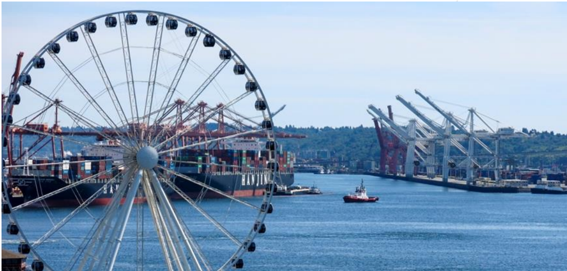
Photo 15.5 Seattle Waterfront

The combined Tacoma and Seattle ports in 2014 were the third largest container gateway in North America and the two marine cargo operations support more than 48,000 jobs in the local area. 761 The merger of operations is expected to position better the Puget Sound Ports for the competitive challenges ahead. The two ports have to submit a detailed agreement to the US Federal Maritime Commission in June 2015. At present, they are operating under an Inter-Local Agreement which came into effect on 1 December 2014. Formal due diligence continues through 2015.