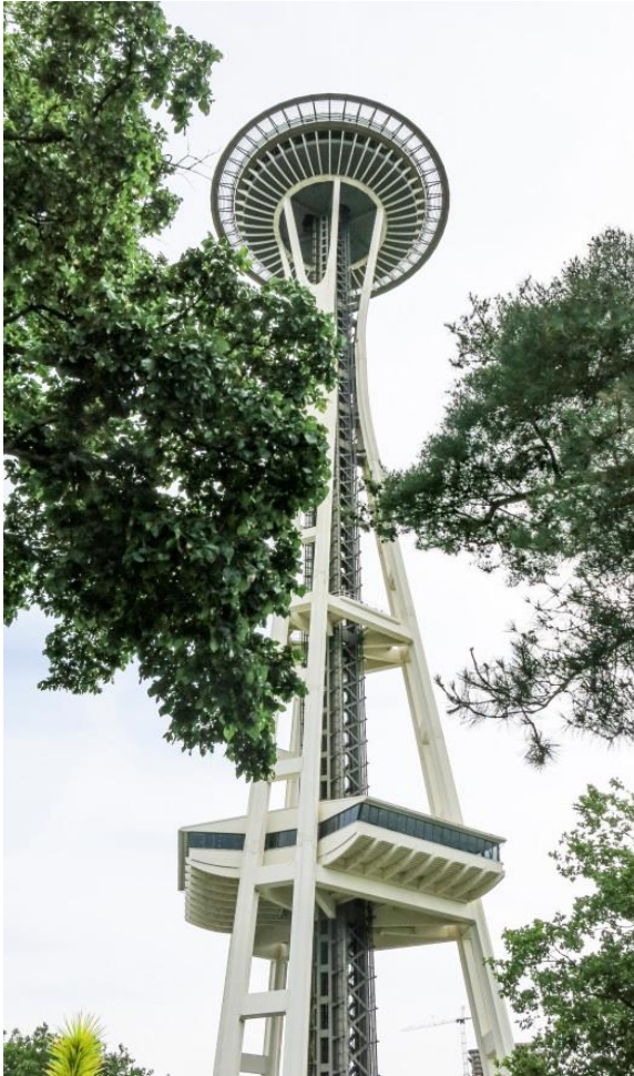
Photo 15.1 Seattle Space Needle