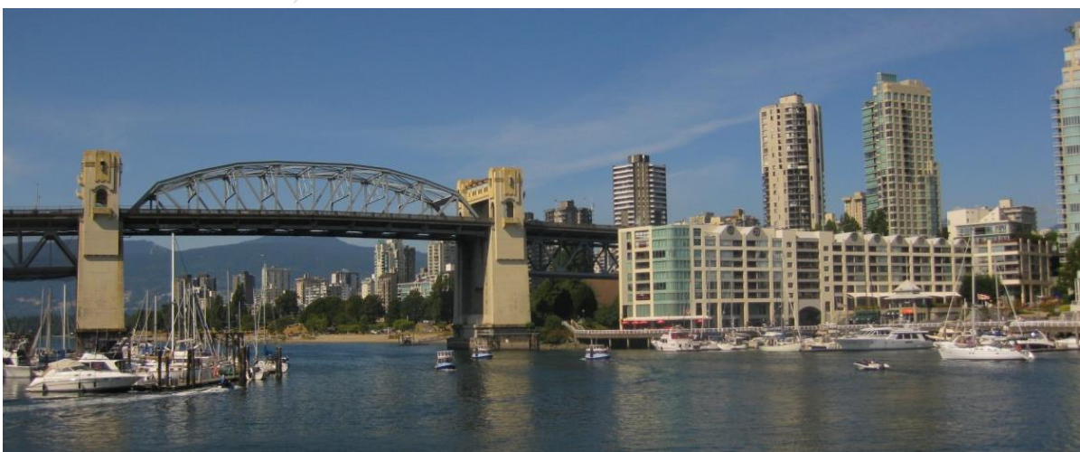
Photo 15.2 False Creek, Vancouver

Some serious policy rethink is needed by the relevant United States and Canadian agencies as to how to make the I-5 border crossings more efficient and not a deterrent to the growth of both the product and services trade, including the all-important tourism market. It would seem, from an outside observer, that at least during the peak tourism times, more inspection lanes could be facilitated by having temporary inspection stations either in front or behind the permanent structures. Longer term solutions could include extending the port of entry to allow more inspection lanes or use of new technology.