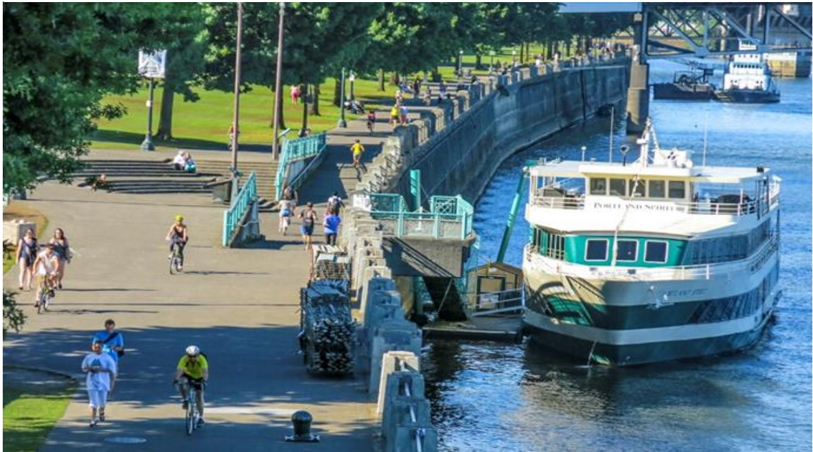
Photo 15.6 Portland Waterfront