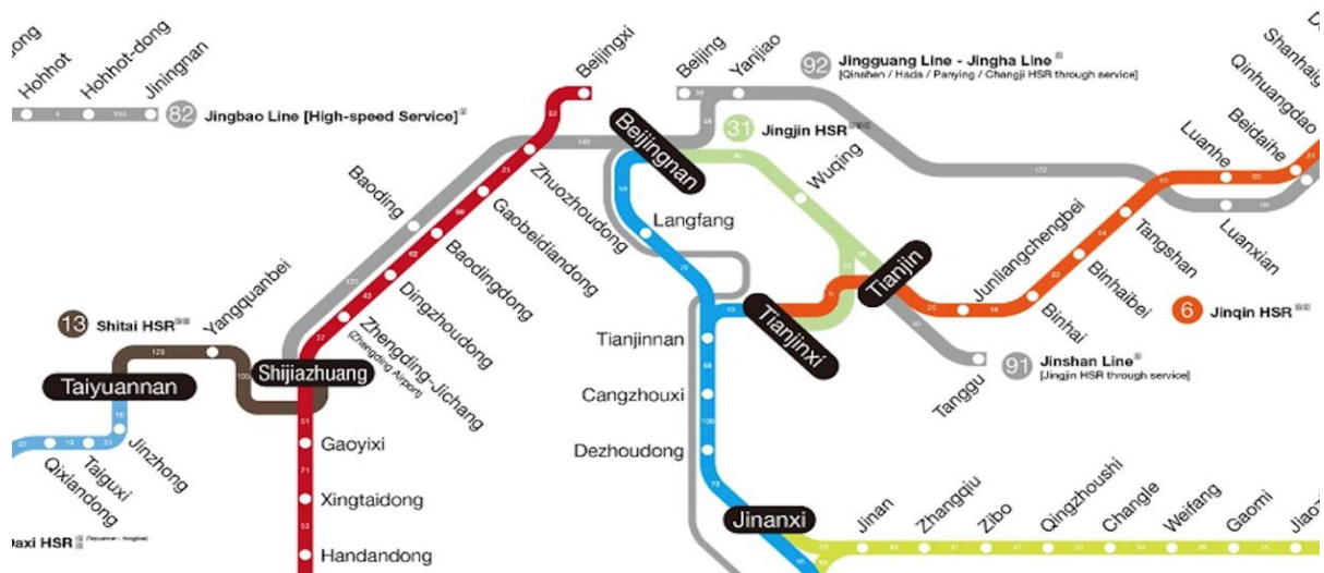
Figure 6.2 High-Speed Railway Network in Jing-Jin-Ji Region