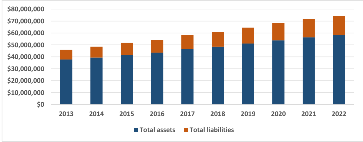
Figure 2.6 Ten-year Forecast for Assets and Liabilities, Auckland City

assets, depreciation schedules for valuing assets, and a forward 10-year balance sheet showing debt to equity (Figure 2.6). Debt to equity varies between 24 percent and 27 percent.