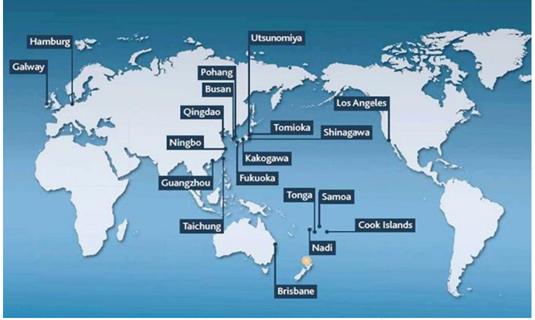
Figure 2.7 Auckland's Formal Partnerships