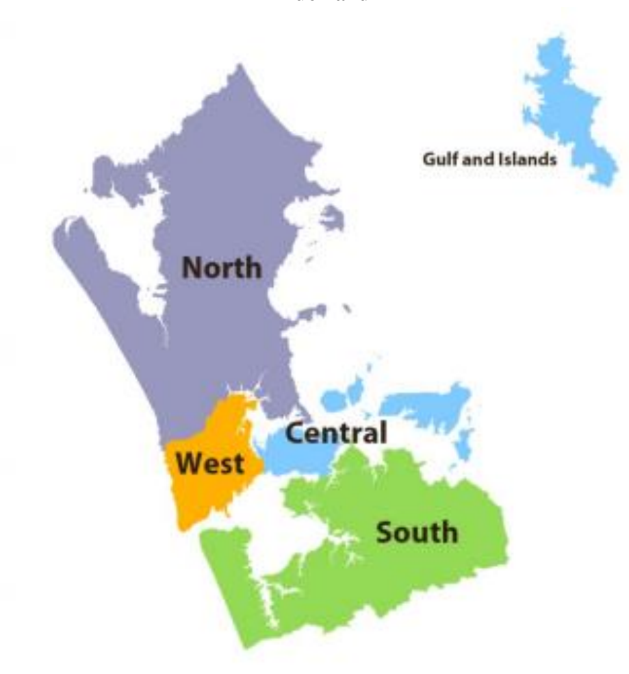
Figure 2.3 Employment Regions in the City of Auckland

Auckland's metropolitan area is divided into four geographic and economic subregional districts (Figure 2.3). The metropolitan commercial centres are located in the North Shore ('North'), Newmarket, Ellerslie and the Central Business District (CBD) ('Central'), and Manukau ('South'). The major contributing area to the city's GDP is Central. The polycentric structure of the city is the product of its geography, historical development and the former local government system. Until 2010 Auckland was governed by seven local councils. These were combined in 2010 to create the present Auckland Council. As a result, there are strong economic linkages between regional industry, commerce, retail and local government centres of the previous structure. 97