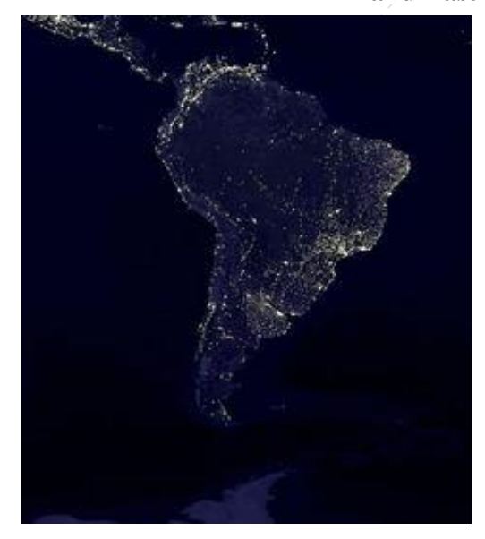
Photo 1.2 Lights Showing Emerging Corridors of Cities in South America (left) and East Asia (right)