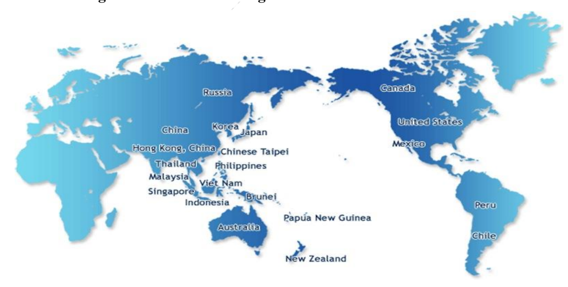
Figure 1.1 Asia-Pacific Region and APEC Member Economies

The Asia-Pacific is vast, with 46 economies spread around the Pacific Ocean rim. Distances and travel times between cities and economies in the region are substantial. Despite this, APEC economies are becoming increasingly interconnected and dependent on each other for their growth, development, trade, investment, and security.