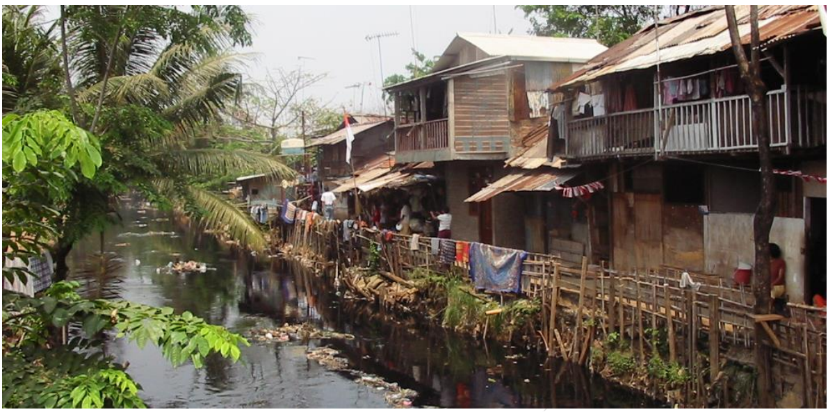
Photo 1.3 Slum Settlements: A Major Challenge to Improving Living Conditions in Some APEC Economies