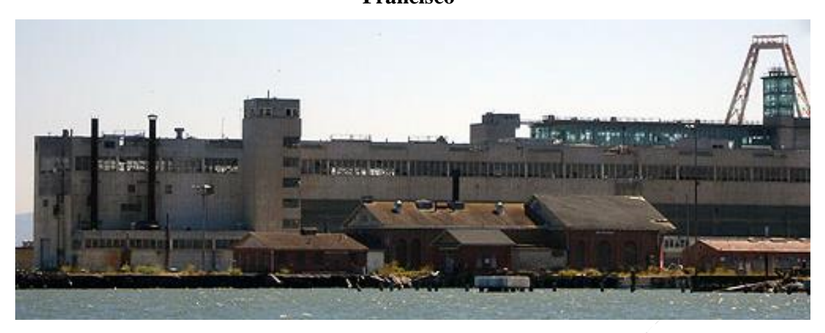
Photo 1.3 The Greying of Cities: Hunter's Point Naval Shipyard Buildings, San Francisco