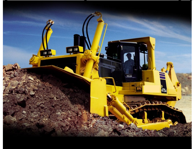
Figure 4.1. Earth moving, construction and moving equipment