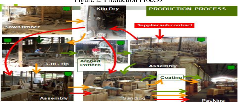
Figure 2: Production Process

In 2012, WKPI had three main wood suppliers and nine semi-finished wood product suppliers who also had to obtain SVLK certificates in order that WKPI could fulfill the requirement for legal compliance of raw materials and the legality of production. WKPI also had to keep all supporting documents related to raw materials and production process for auditing purposes related to SVLK (Figure 2).