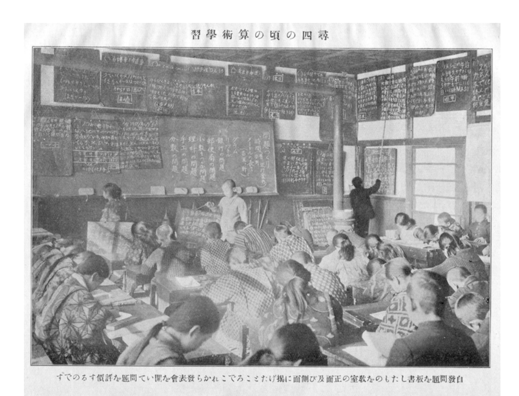
Figure 3. Problem Posing Approach by Jingo Shimizu (1924)

<u>Problem Solving Approach for Leaning by/for themselves</u>: Japanese Problem Solving Approach, known as the process through 'posing a problem', 'independent solving', 'comparison and discussion', and 'summary and application', was known in the US through the comparative study on problem solving in the 80s by Tatsuro Miwa and Jerry Becker. It influenced the world through the TIMSS video study in 90s (Stigler and Hiebert 1999). Problem Solving Approaches are one of the shared approaches in Japan and developing such a sharable approach itself is one of the long-term results of lesson study. Lesson study spread into the world with Problem Solving Approach. It may not have been spread if it were only explained by the lesson study cycle. The problem solving approaches combined with lesson study has spread to the world from Japan through the comparative studies and teacher training programs for developing countries from 1980s, the Japan International Cooperation Agency's projects from 1993 (See, Isoda et al 2007) and APEC projects from 2006.