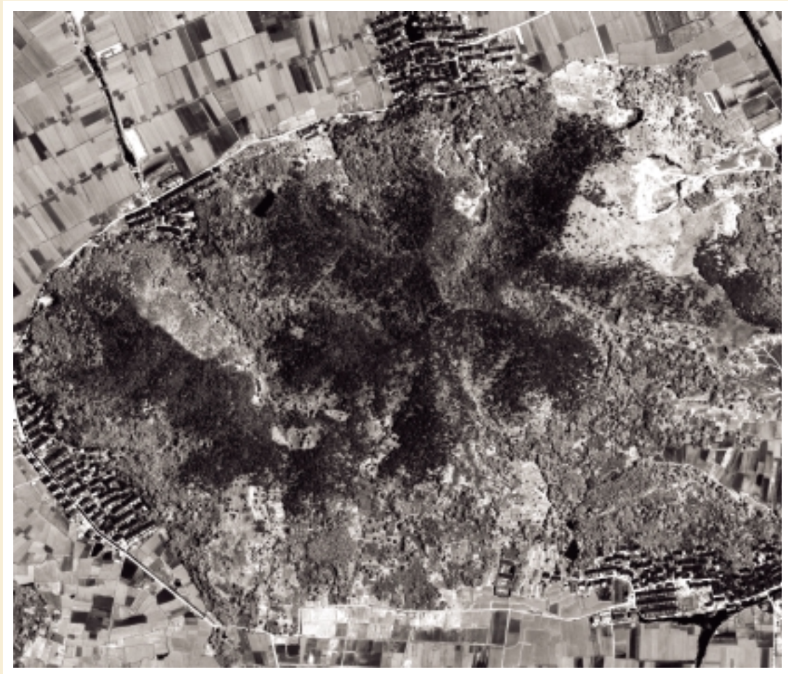
1-meter panachromatic image of IKONOS