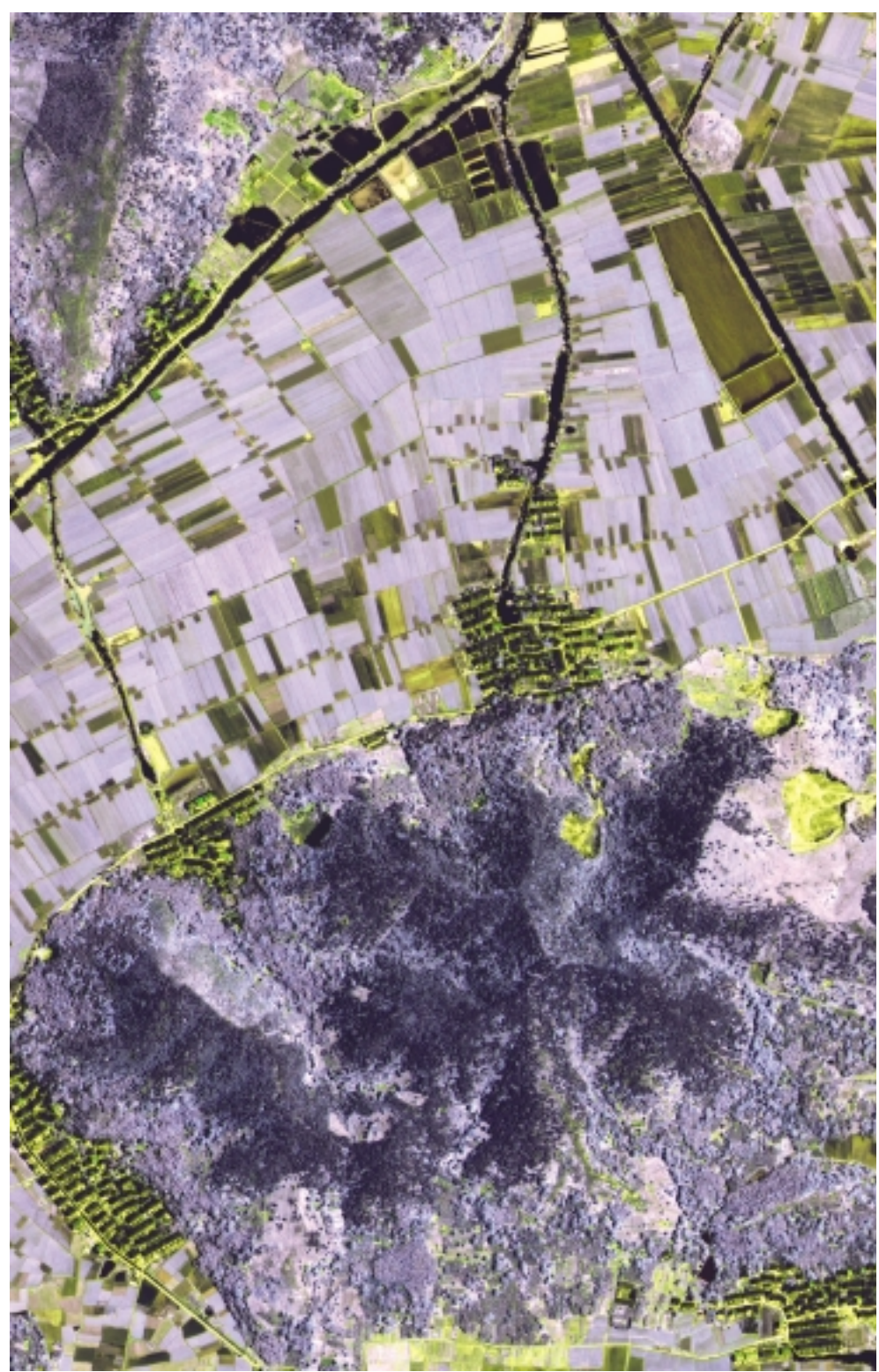
Merge image of IKONOS