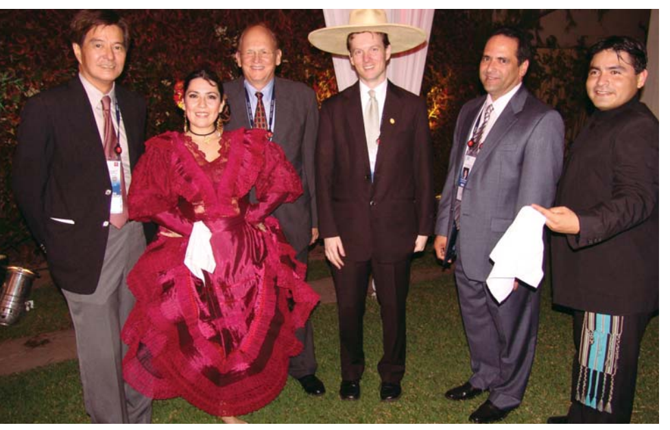
Participants at the Forum were introduced to Peruvian culture by national performers

Australia and Indonesia signalled that they hoped to share the findings ahead of the Concluding Senior Officials Meeting (CSOM) in mid-November 2008.