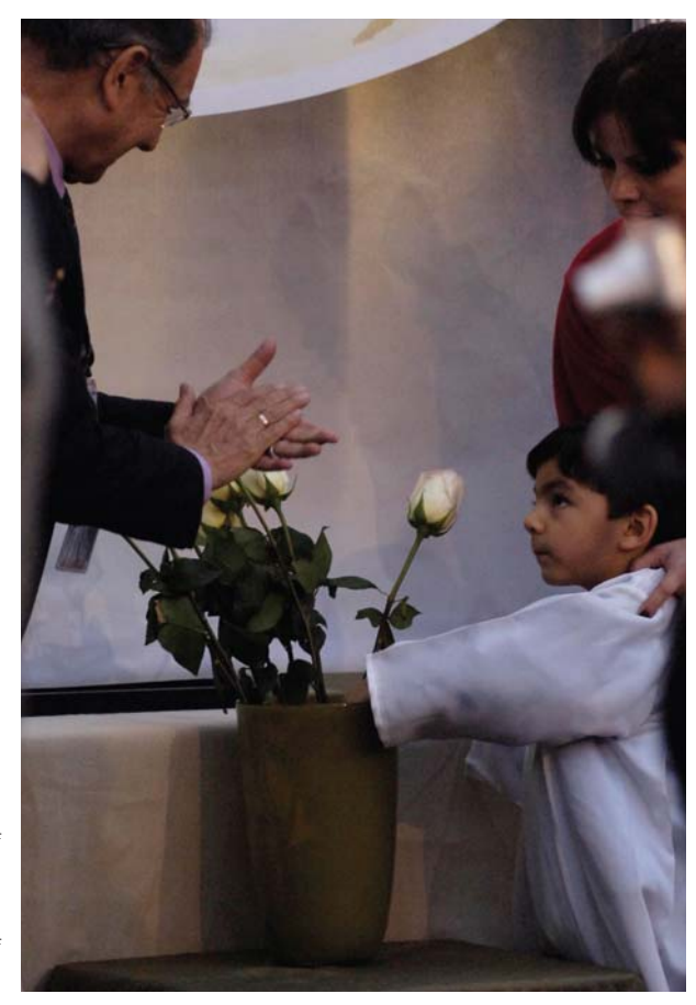
Marking the one year anniversary of the devastating Pisco earthquakes in Peru, local children lit 21 candles to commemorate the victims of disaster in all APEC economies