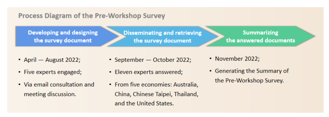
Figure 1. The process of the Pre-Workshop Survey