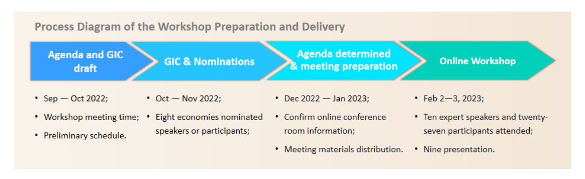
Figure 2. The process of Workshop Preparation and Delivery

Firstly, from September to October 2022, the agenda and GIC draft were created, and the meeting time and preliminary schedule were determined. From October to November 2022, GIC was circulated among APEC economies and eight economies, Australia; China; Japan; Malaysia; the Philippines; Singapore; Thailand and the USA, nominated speakers or participants, followed by determining the agenda and preparing for the meeting from December 2022 to January 2023, as the workshop was postponed from mid-December to February 2023 due to the COVID-19. Finally, the online workshop took place on February 2-3, 2023, with ten expert speakers and twenty-seven participants attending and nine presentations were given.