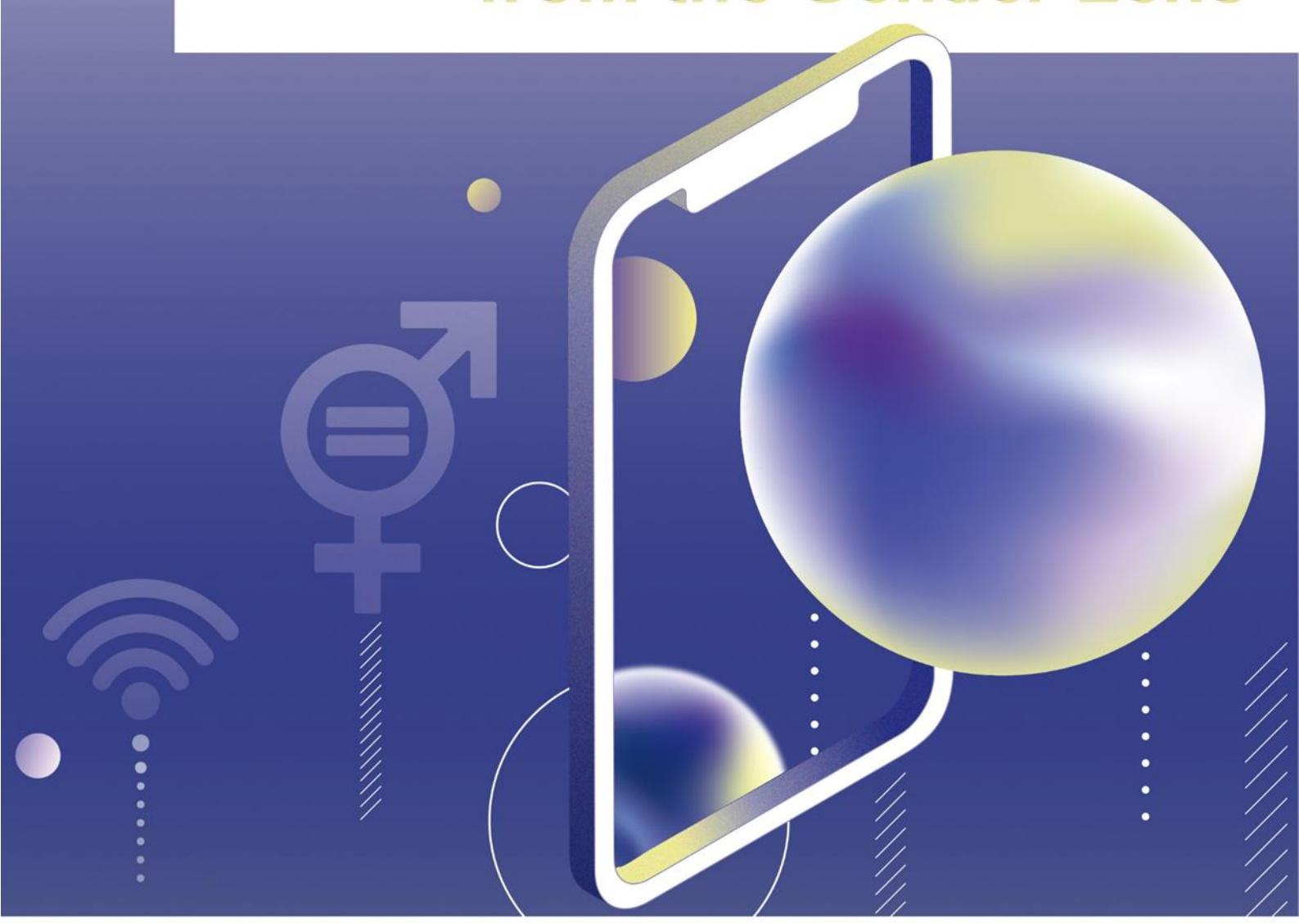
APEC Human Resources Development Working Group January 2024