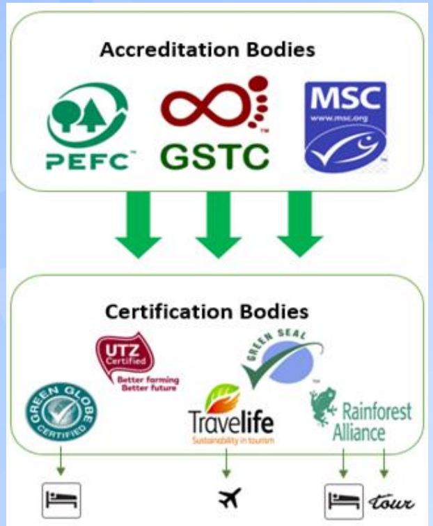
Figure 3: Relationship between accreditation and certification bodies

Source: Adapted from Durband, Randy. Keynote Presentation: "Promoting Responsible & Sustainable Tourism in MSMEs in the APEC Region". Brainstorming Workshop towards an APEC Green Road. Chiang Mai, Thailand. 4 September 2018.