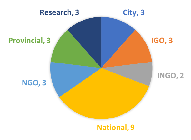
Figure 2: Jurisdictions Attending A full list attendees is included in Appendix 3.