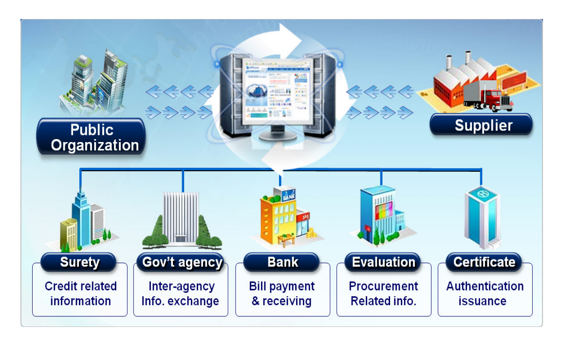
Box 1. Conceptual diagram of KONEPS's data exchange links

KONEPS comprises over 10 sub-systems, including electronic tendering system, document exchange system and other support systems for catalogue and supplier performance management. It presents several distinctive characteristics owing to its extensive architecture: