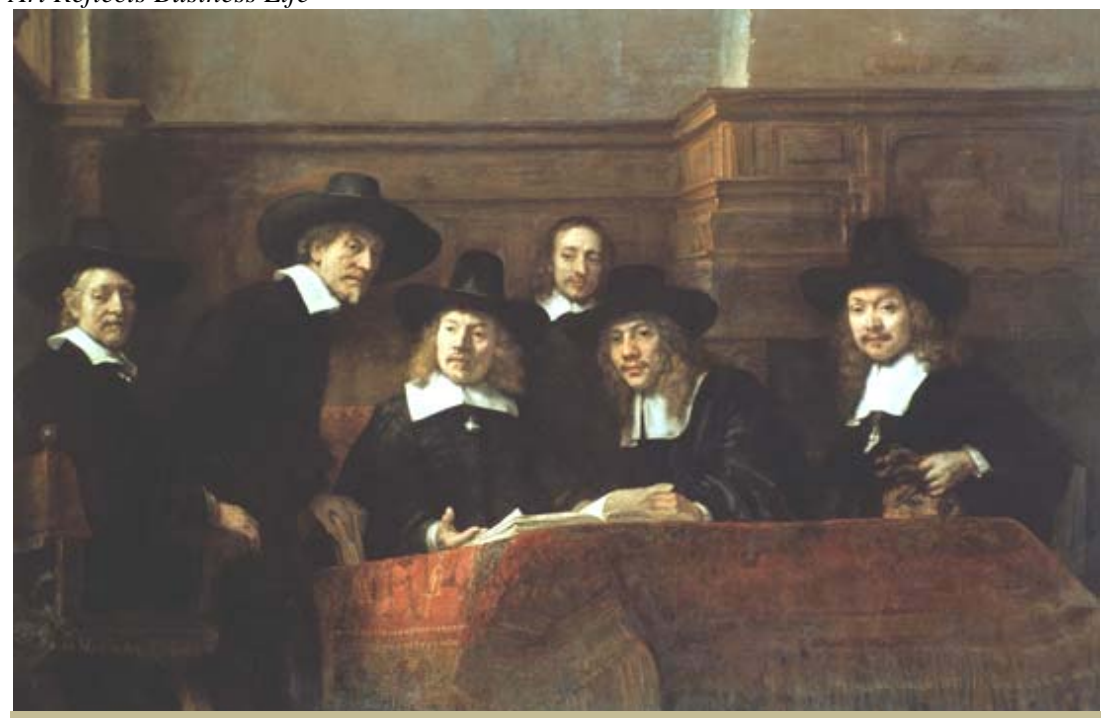
Exhibit 1-1 Art Reflects Business Life

Portraits of guild masters and businessmen in 17<sup>th</sup> century Netherlands, by Rembrandt and other artists, represented a revolution in art based simply on their subject matter. Until that time most art dealt with religious figures or classical myths and legends. Portrait art was reserved for the nobility or church hierarchy. These businessmen were showing an increased willingness and capacity to pool their talents and fortunes together into joint enterprises. And some of these groups had become successful and important enough to commission group portraits of themselves – reflecting in art the new trend in commerce. The subjects in this painting by Rembrandt are the members of cloth dying guild in the Netherlands.