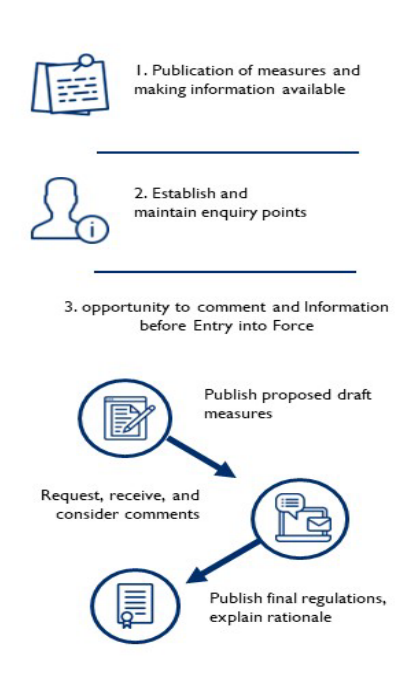
FIGURE 1.1 APEC TRANSPARENCY PROVISIONS

Most APEC economies either have some form of legal framework in place or have adopted whole of