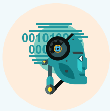
Artificial intelligence and machine learning

Prior to COVID-19, the global economy already entered a new era of automation termed the Fourth Industrial Revolution (4IR) characterised by: