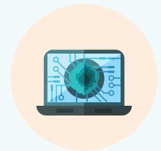
Real-time and predictive analytics

When managed effectively, 4IR can help economies reach higher levels of productivity at lower input costs while making new industries and jobs possible.