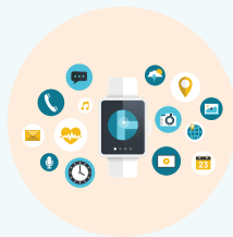
Internet of Things