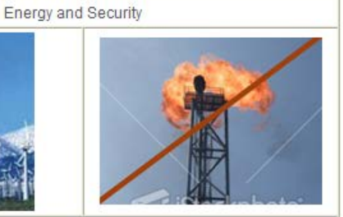
Looks like an explosion, suggesting violence or terroism