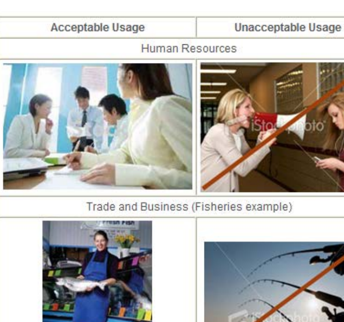
Suggestive of rude / bad behavior