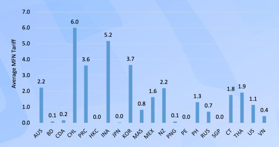
Figure 2. APEC List of Environmental Goods: Average MFN tariff per economy

AUS=Australia; BD=Brunei Darussalam; CDA=Canada; CHL=Chile; PRC=China; HKC=Hong Kong, China; INA=Indonesia; JPN=Japan; KOR=Korea; MAS=Malaysia; MEX=Mexico; NZ=New Zealand; PNG=Papua New Guinea; PE=Peru; PH=The Philippines; RUS=Russia; SGP=Singapore; CT=Chinese Taipei; THA=Thailand; US=United States; VN=Viet Nam. MFN=most favoured nation