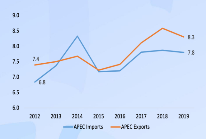
Figure 3. APEC trade in hydrogen compressors (USD billion)

In the case of the Regional Comprehensive Economic Partnership (RCEP), three of its members will fully liberalise hydrogen compressors from the date of entry into force of the RCEP, and seven members will do so within periods ranging from 10 to 20 years. However, one member is only partially liberalising one type of hydrogen compressor and three others are excluding at least one type of such compressors from the liberalisation process.