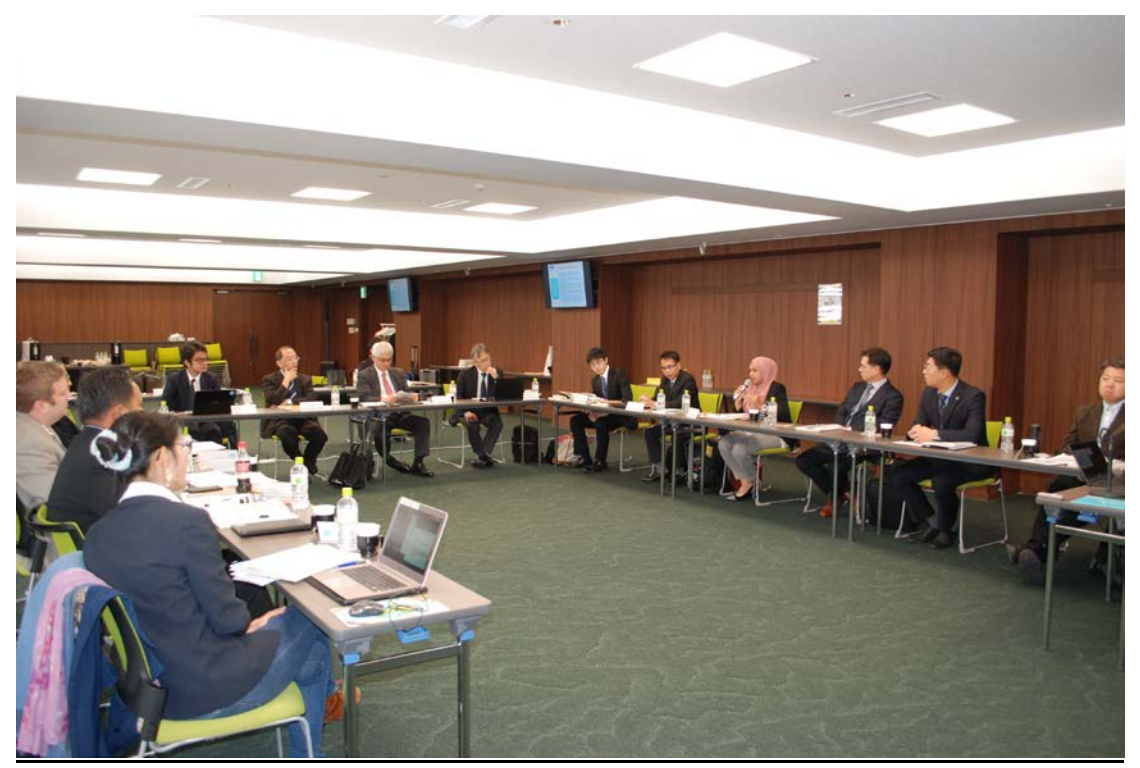
Fig.9 Workshop (2 of 2)