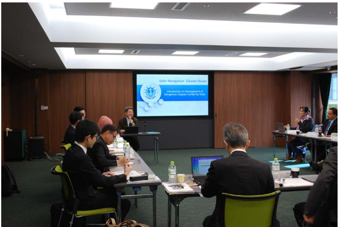
Fig.9 Workshop (1 of 2)