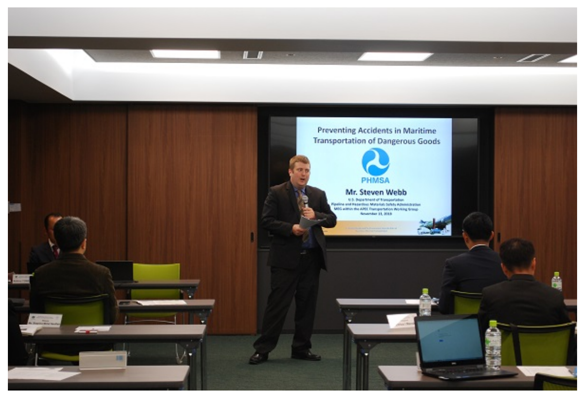
Fig.2 <u>Keynote speech: Preventing Accidents in Maritime Transportation of Dangerous</u> <u>Goods</u>