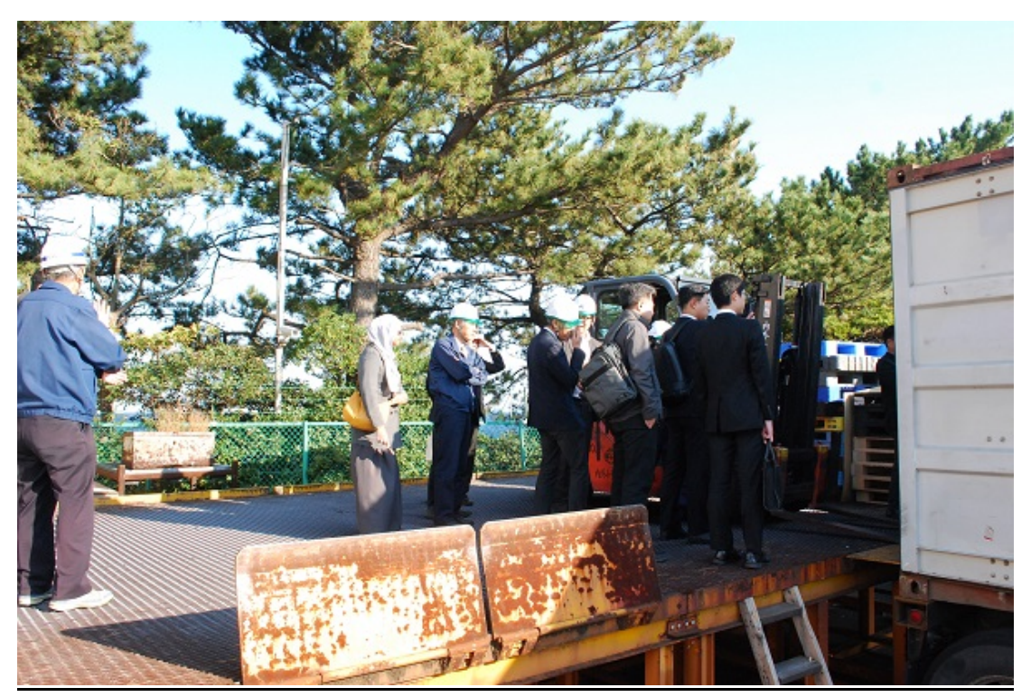
Fig.4 Technical Tour (2 of 2)