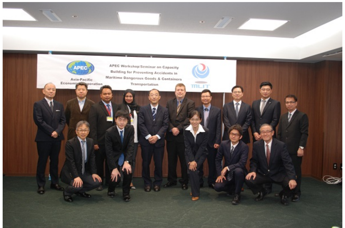
Fig.1 Group Photo