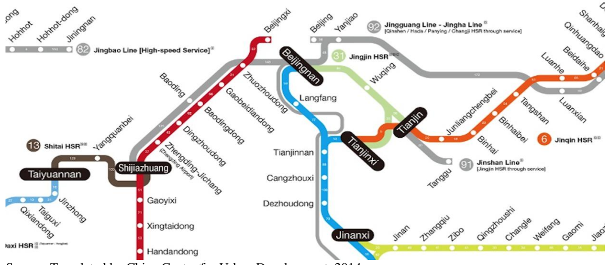
Figure 6.2 High-Speed Railway Network in Jing-Jin-Ji Region

While the ambitious infrastructure spending has resulted in effective logistics infrastructure, urban infrastructure remains a challenge. Water, wastewater and solid waste services have lagged behind. Education and health services also are failing to meet the expectations of citizens. For the migrant population, services are even less accessible. Information and communications infrastructure, overall, is good within the major cities and industrial estates, but is less established in the rural areas of Hebei province.