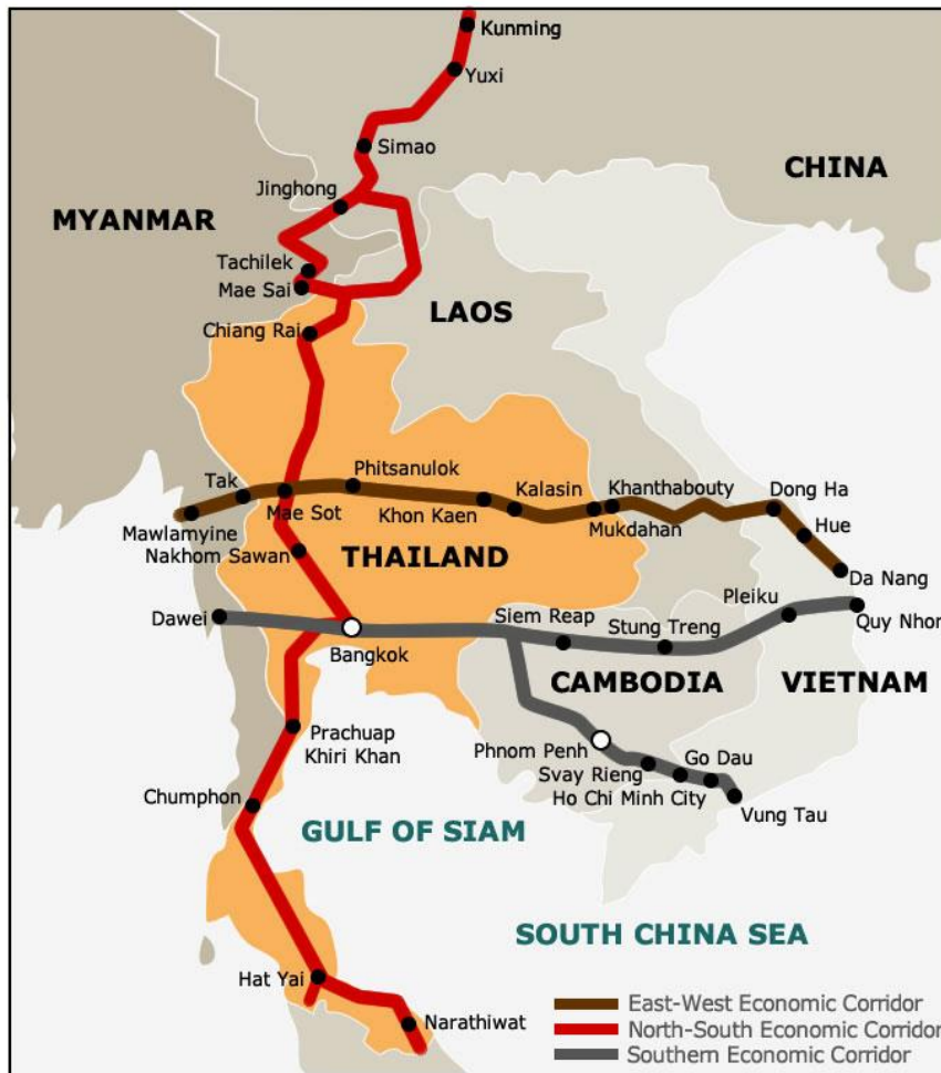
Figure 4.1 The Southern Economic Corridor (SEC) of the Greater Mekong Subregion (GMS)