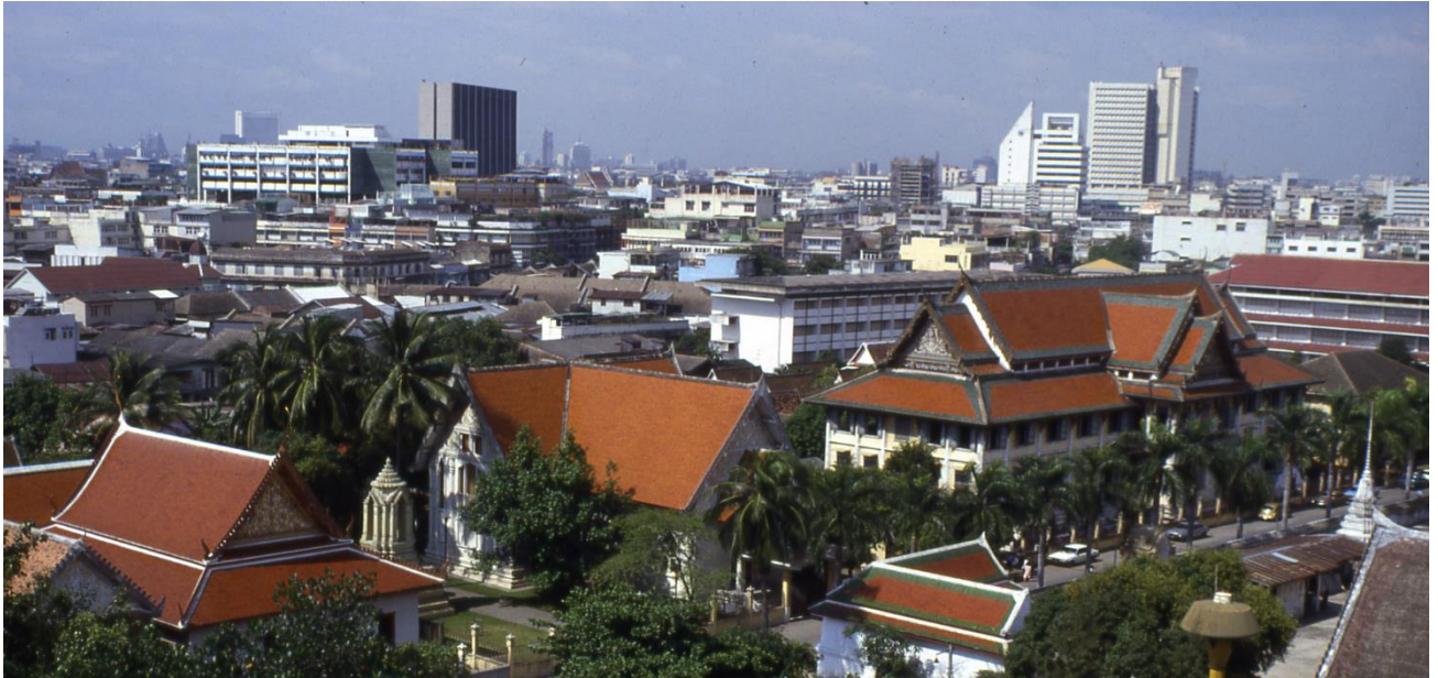
Photo 4.1 Bangkok's Old City Centre