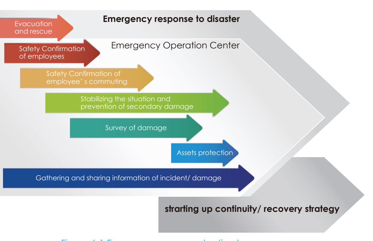
Figure 6-1 Emergency response to disaster

These eight activities are described in further detail below.