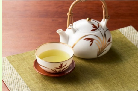
Yame green tea