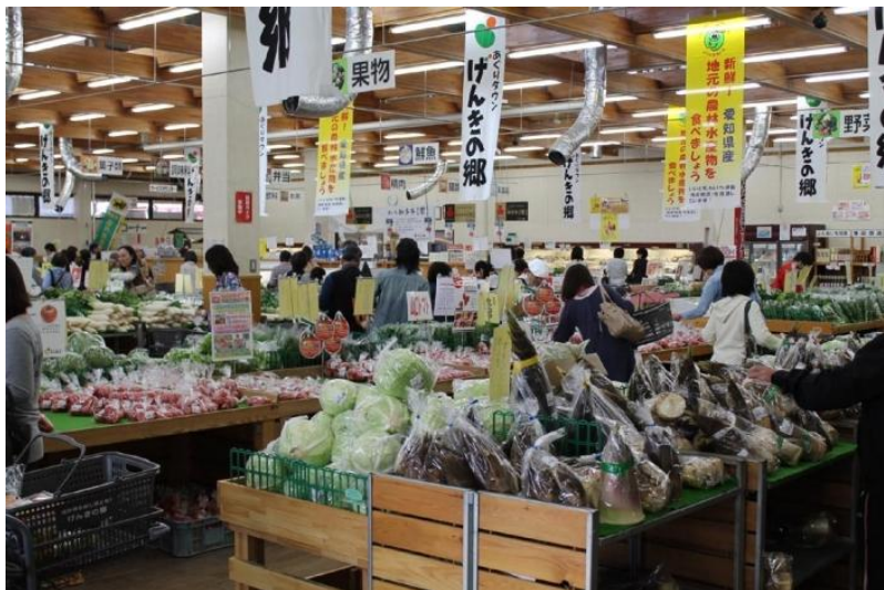
Farmers' Market (JA-Aichi Chita, Aichi pref.)