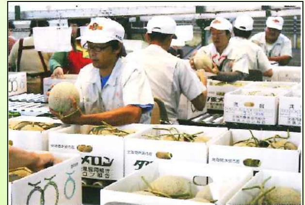
Inspectors are checking Yubari melons at the sorting center of JA-Yubari city