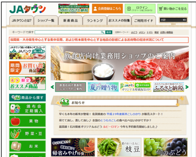
Web Marketing (JA-Zennoh (National level))