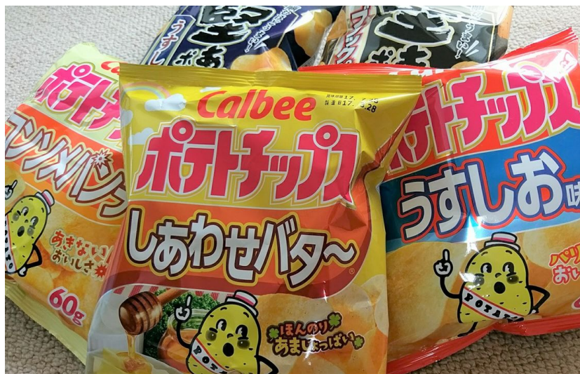
Direct Marketing to Companies (JA-Shihoro town, Hokkaido pref.)