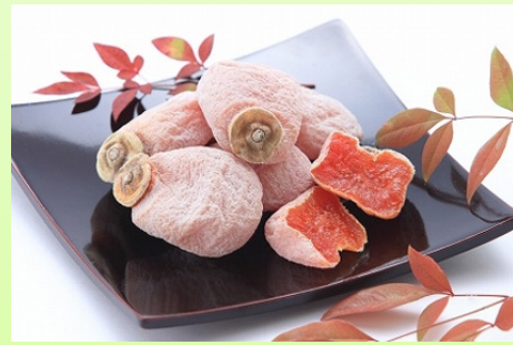
Ichida dried persimmon