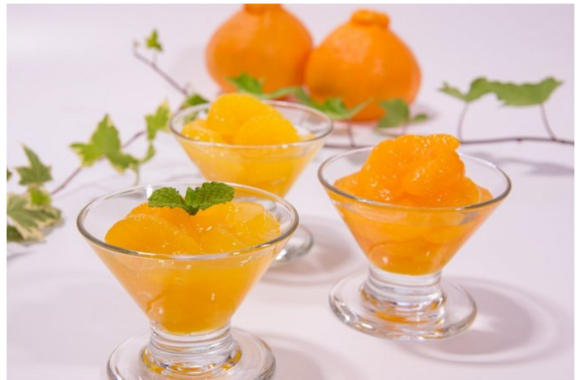
Sixth Order Industry (JA-Ashikita, Kumamoto pref.)