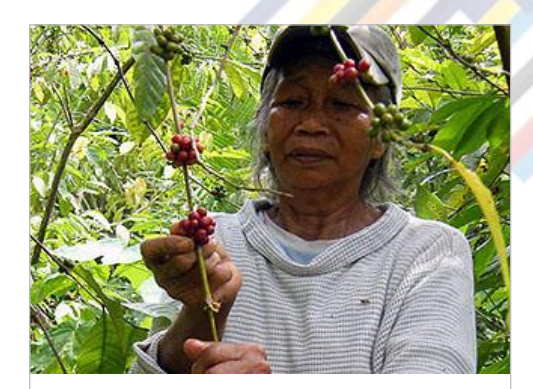
Multinational Company sourcing 30% of Robusta coffee beans from local farmers

WORKED WITH PARTNERS FOR TECHNICAL, CAPITAL AND FINANCIAL ASSISTANCE FOR SMALL HOLDER FARMERS