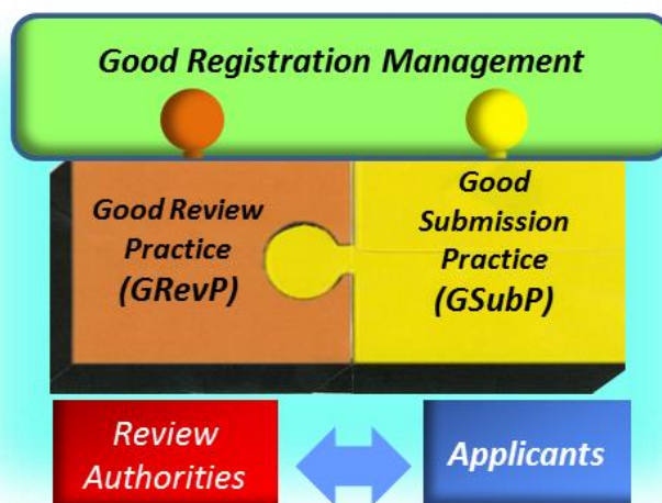
Fig. 1 Concept of GRM